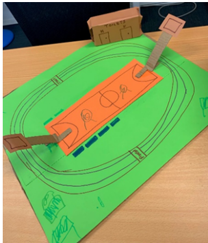
A new running track

Here are some of their fabulous designs so far.