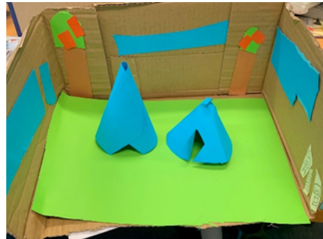
A camping area